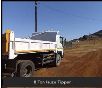
8 Ton Isuzu Tipper