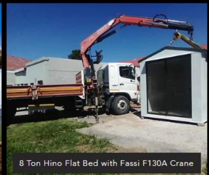
8 Ton Hino Flat Bed with Fassi F130A Crane