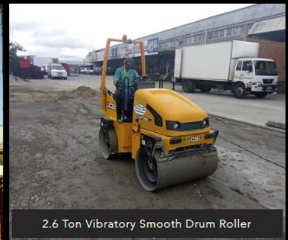
2.6 Ton Vibratory Smooth Drum Roller