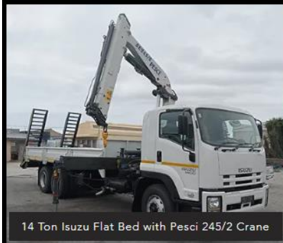
14 Ton Isuzu Flat Bed with Pesci 245/2 Crane