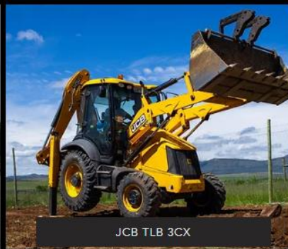
JCB TLB 3CX